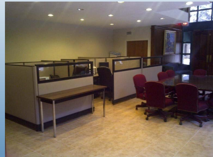
International Supply Chain Integration Center