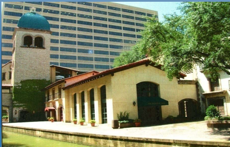
U.S.-Mexico Chamber of Commerce Building